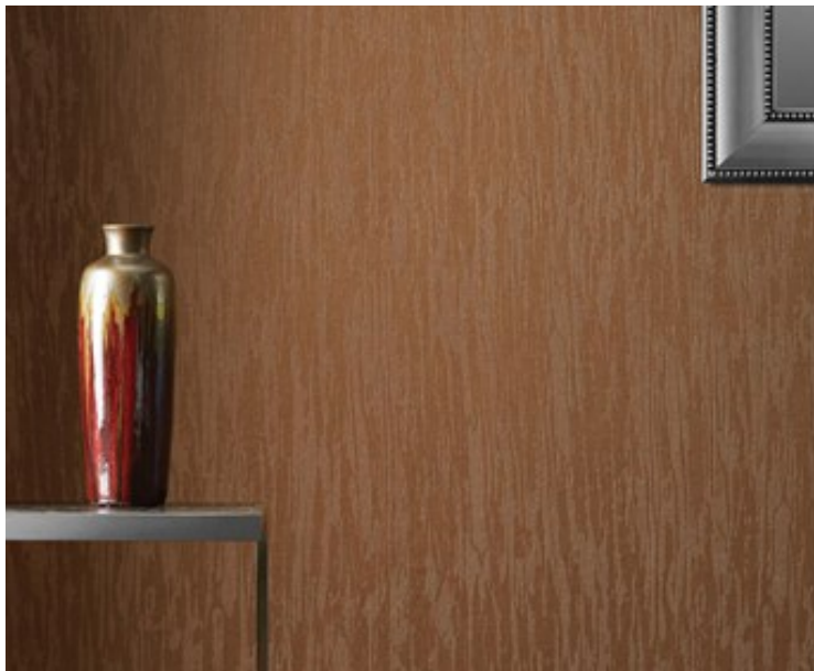
Figure 1 Bio Xorel® X-Protect Wall Covering

Baresque is the Australian distributor of Bio Xorel products.